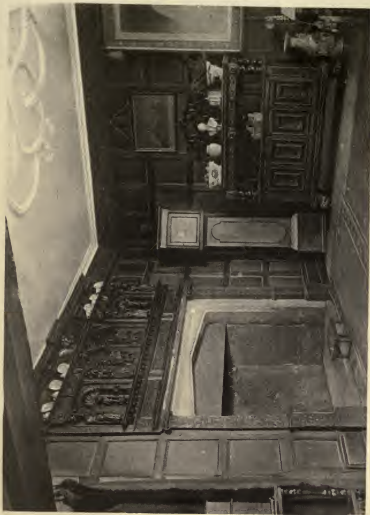
The Priory House, Salisbury. The Dining Room